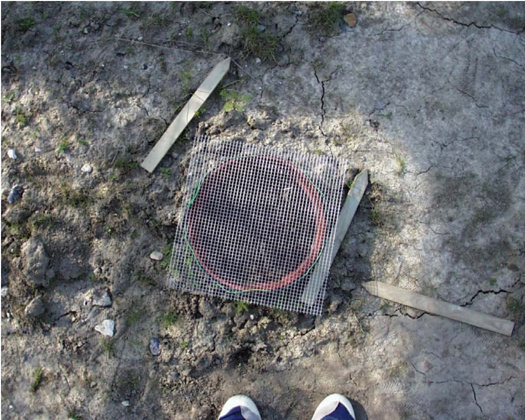
Fig. 3. Example of lid for one sample.