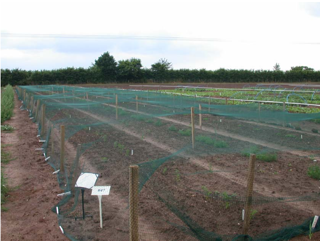
Fig. 4. Example of netting/caging the whole experimental area.